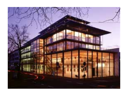
Institute / Arithmeum

The institute is in the same building as the Arithmeum. The University Club is located just across the Hofgarten park, close to the Rhine River. Both buildings are only a few hundred metres from the downtown pedestrian area.